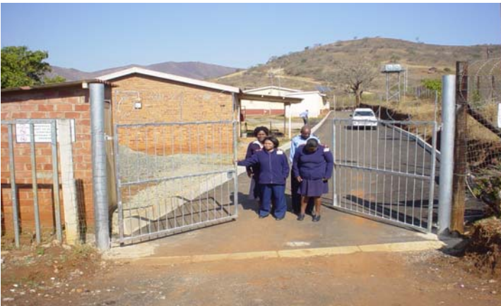
Isithundu Clinic after renovations