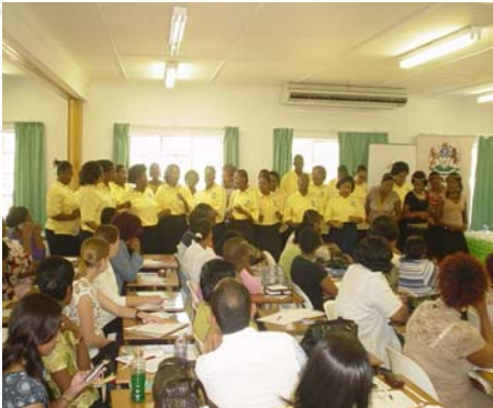
Professionals during the Seminar