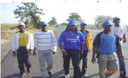
Above pic: They walk like they have motor engines. “Keep walking guys”, It is good for your health”

The main purpose of the fun walk was to promote healthy lifestyle and also to promote team building amongst the staff. The walk started from Kearsney clinic to Ilembe District office which was about 8 km's.