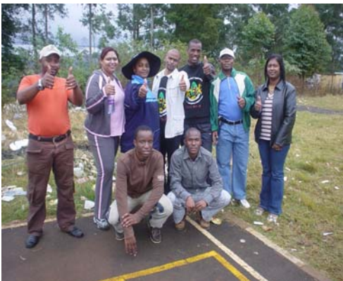
Ilembe Health District Staff saying thumbs up after completing the walk

This initiative started by Ethekwini Community Church and the Department of Health was the sponsor of the event. This walk started from Ilembe District Municipality to Stanger South Secondary where the learners were discouraged on drugs and unprotected sex. The team then continued to Mapumulo Sabuyaze Sports Ground, the awareness was also done to about 300 learners of Sabuyaze High School.