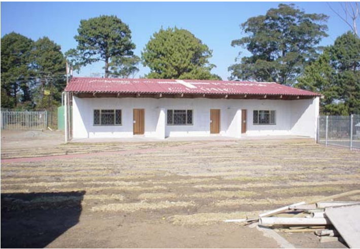
Mbhekaphansi Clinic before