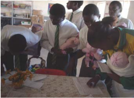
Learners carrying baby dolls

The project baby was initiated at Qoqulwazi Secondary School last year to 66 grade 8 learners. Health education on teenage pregnancy and its consequences as well as life skills on healthy lifestyle was conducted.