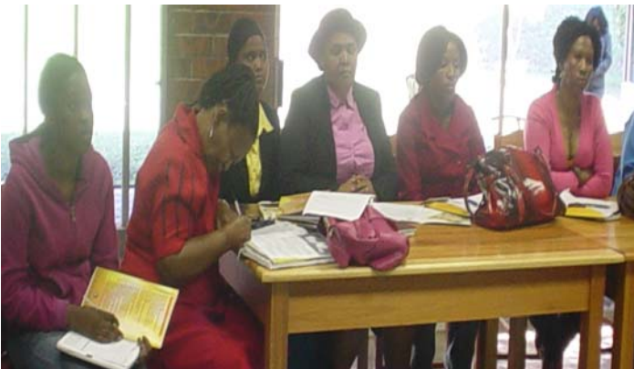
Environmental Health Staff during the training

APPRECIATION LETTER FOR STANGER HOSPITAL