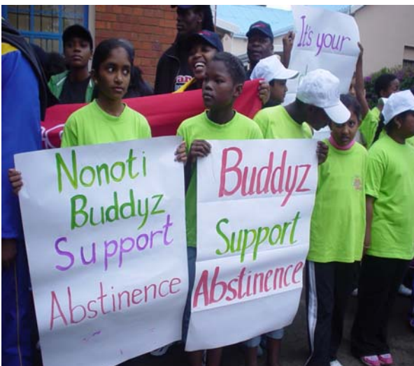
Nonoti Buddyz during abstinence walk