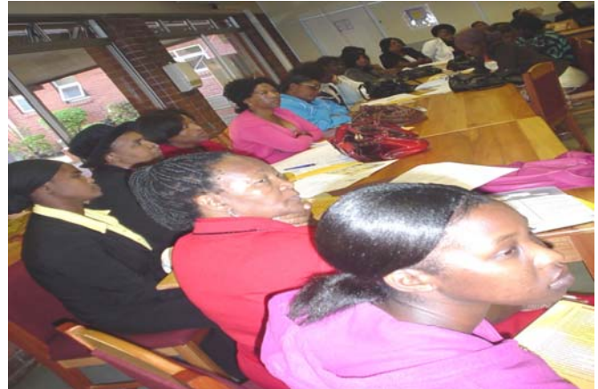
Environmental Health Staff during the training