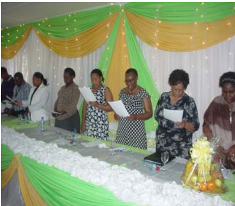
Guests doing Khanya Africa & doing Nurses pledge