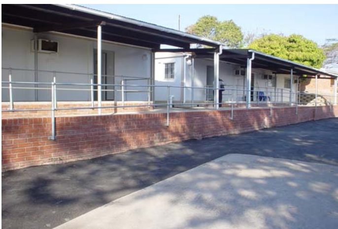
Paving and retaining wall at Groutville Clinic