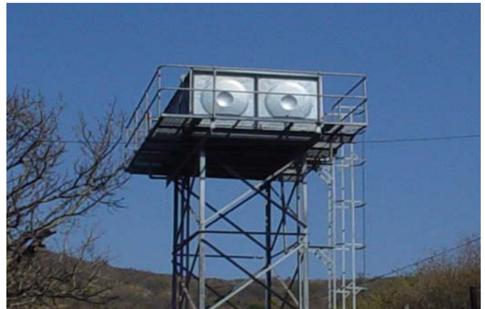
New Water tank for Isithundu Clinic