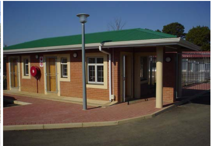
Mbhekaphansi Clinic after