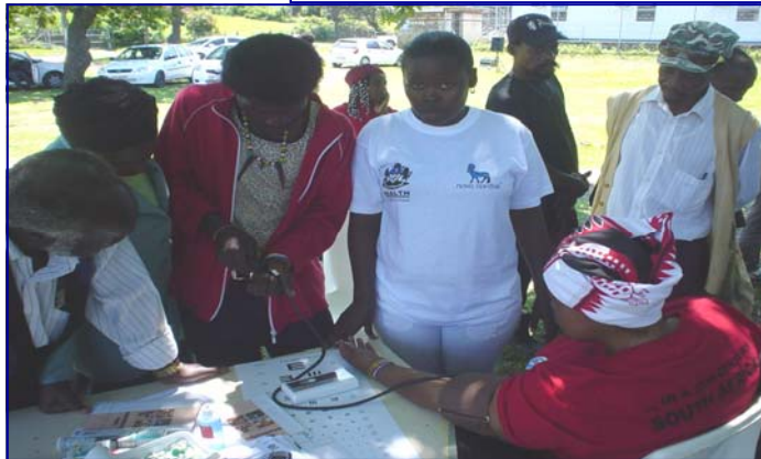
Traditional Healers assessing one another with a help of a T-Seven Member.

“Department of Health is urging them to first test Blood Pressure, Blood Sugar and Eye test before they commence their medication”.