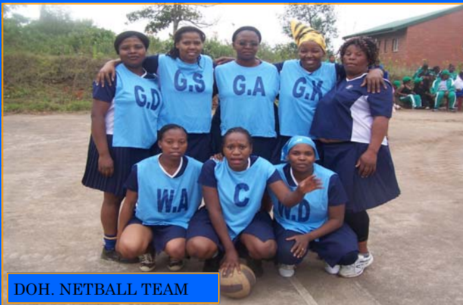
DOH. NETBALL TEAM