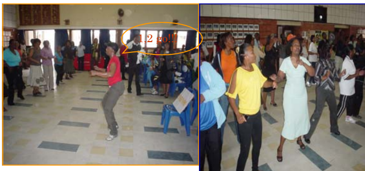
Teachers during the exercise