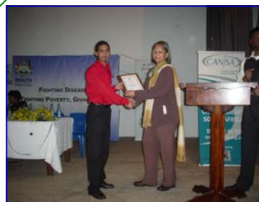
Thanks for the Sponsorship. You shine.