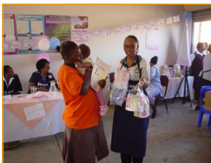
1st prize winner in category 7-12 months.