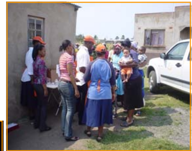
Staff members during the campaign