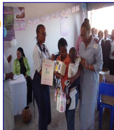
1st prize winner in category 13-18 months.