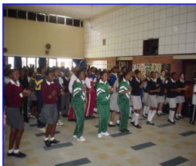
Learners during the exercises