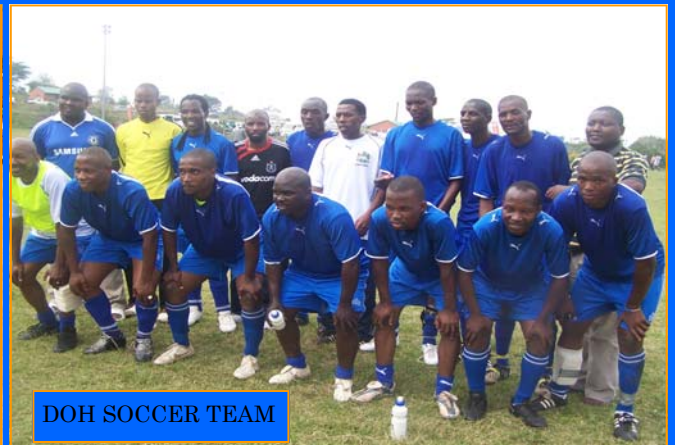
DOH SOCCER TEAM