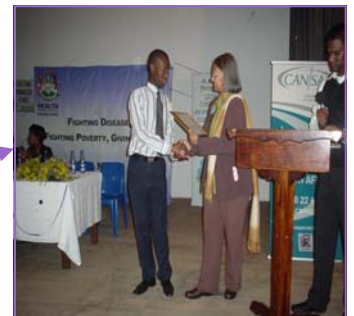
Thanks with the Venue S.H.S.