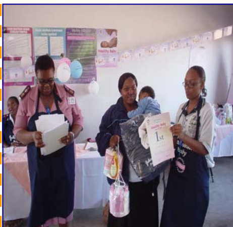
1st prize winner in category 0-6 months.

There were three winners i.e number 1-3 for each of the prize categories. Certificates were also given to the mothers that won . There were also prizes for mothers & fathers of the babies that had won the competition. As consolation prize, baby carriers from Johnson & Johnson were issued to those mothers who entered competition and did not win.