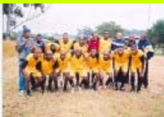
Sports Action P. 4