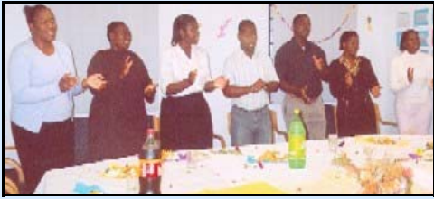
Hospital staff accompanied the hospital Manager on the 24 March 2005.