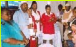
Candle lighting P.1