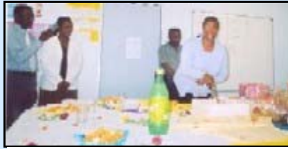
The hospital manager cutting a piece of cake during her birthday

some of the hospital staff gathered together to celebrate the hospital manager's birthday that was celebrated on the 24th of March 2005 inside the hospital Boardroom. HAPPY BIRTHDAY AND SEE MANY MORE YEARS TO COME!