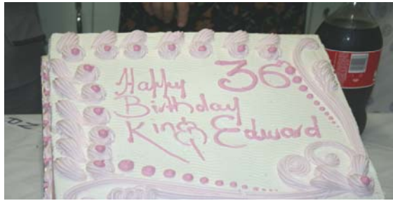
A cake to celebrate Nursery 36th Anniversary