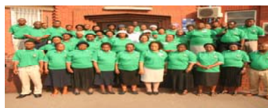
Above picture: ABET Learners from KEH

September 13, 2007 was a special day to celebrate International Literature Day. King Edward VIII Hospital Abet learners also attended this spectacular event. This event was held at Chatsworth Stadium.