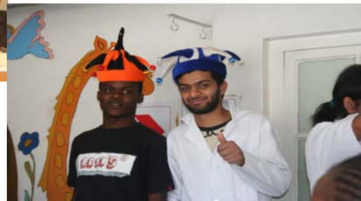
Pharmacy Interns who entertained Kids at Peads