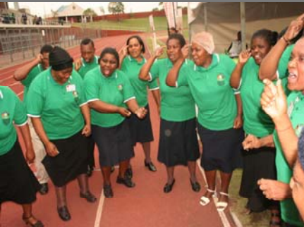
Abet Learners from KEH singing