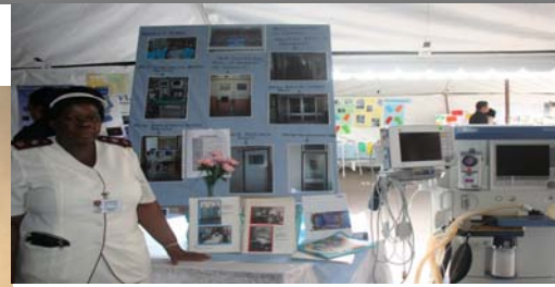
A Sister from Theatre also showing off her QIP on Quality Day