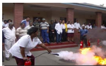
One of the staff trying her hand at extinguishing the fire

A demo was made so that people could observe the handling and the approach when extinguishing the fire. This session was a lot fun as the delegates were very active and involved. After this training people will be going back to their respective departments and conduct presentation. Hopefully we are one step closer in completing our internal disaster drill plan.