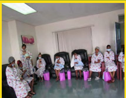
Q&A session to our patient and wonderful prizes giveaways