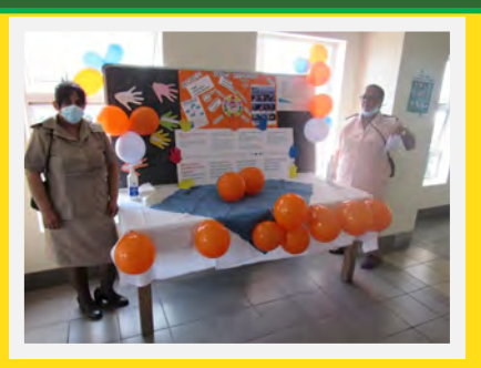
Displace charts from XRAY,A&E, Spine unit, MOPD,POPD, MDR unit