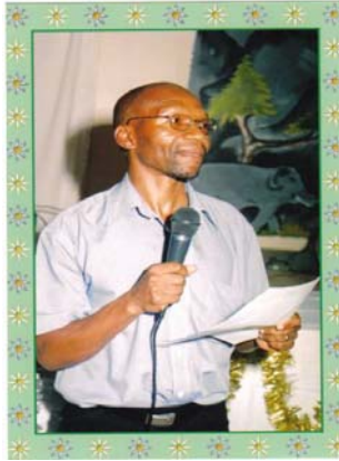
GREETING TO EVERYONE AT MANGUZI HOSPITAL

Although Manguzi Hospital is located in the outskirts of Kwa-Zulu Natal with limited resources, but we still continue rendering quality patient care through commitment and dedication of all our staff members. We also give credits to those of us who have contributed positively in activities developing staff members in different aspects. Through work-