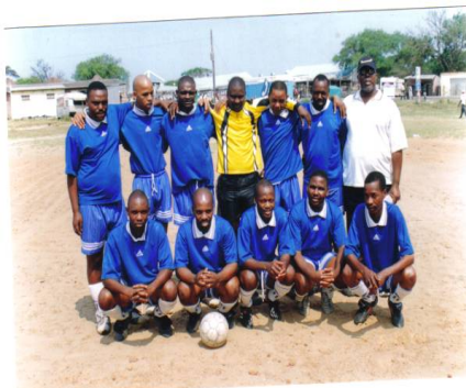
The best team in our Country and in our province.

The Manguzi soccer was playing with Manguzi SAPS soccer team. Manguzi punished Manguzi SAPS with 5-0.