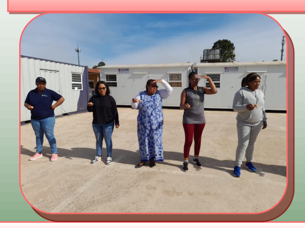
EGG AND SPOON RACE.