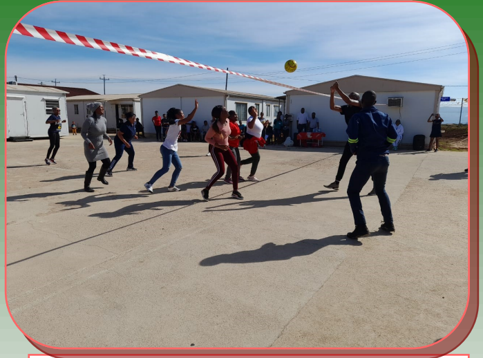
VOLLEY BALL GAME MALES VS FEMALES.