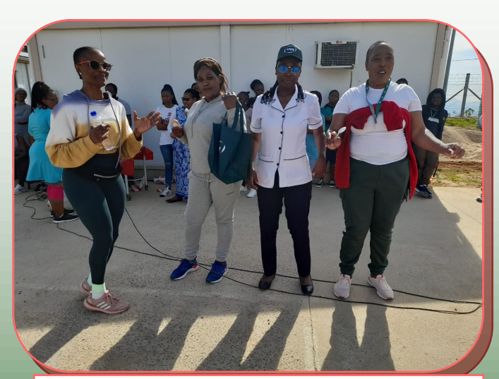
WINNERS OF THE EGG AND SPOON RACE.