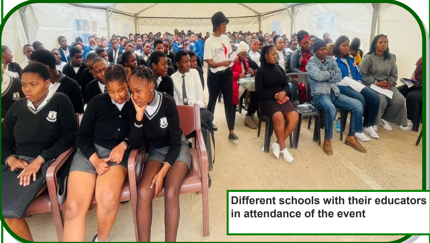
Different schools with their educators in attendance of the event

On the 1st of September 2023, Love Life and Soul City organisation in collaboration with Ndwedwe CHC hosted a behavior change event for neighboring schools. In the event four schools were invited namely Nombika High School, Lihlithemba High School, Maqokomela High School and Sisebenzile High School. All invited schools were tasked to prepare a performance such as poems, roleplays, dance and singing that will raise an awareness about behavior changes faced by the youth.