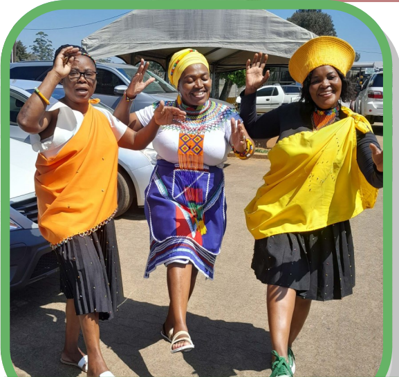
Chronic Department Staff