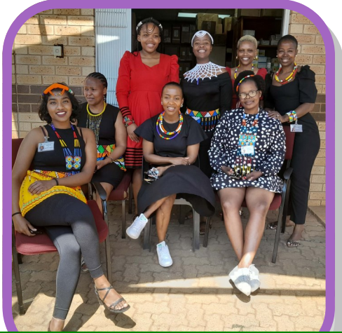
Pharmacy Department Staff