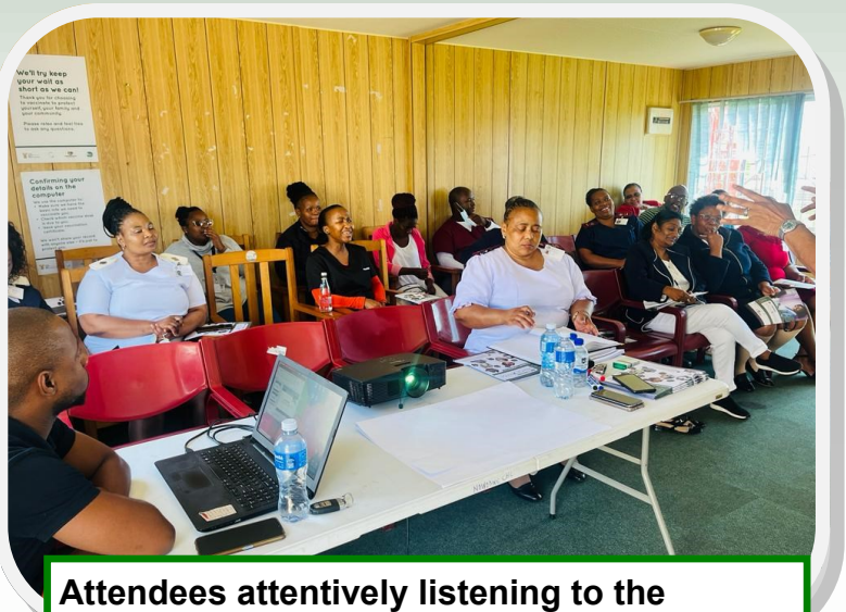
Attendees attentively listening to the presenter