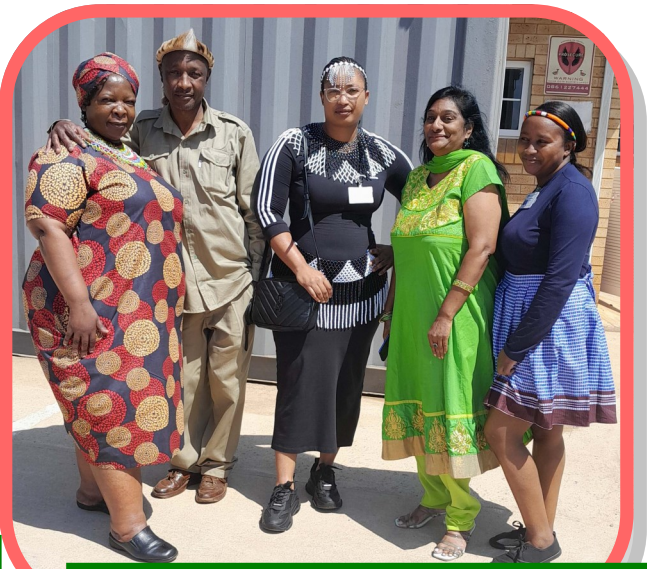
Maternity Department Staff