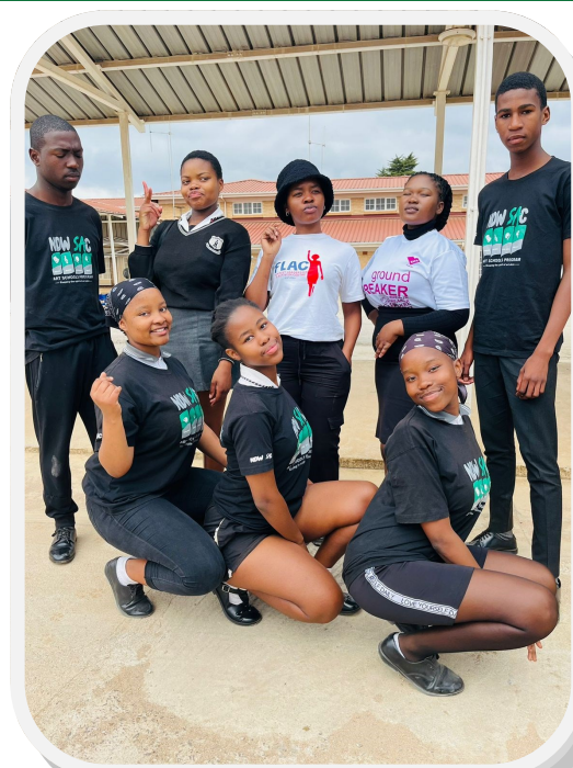
Nombika High School Learners