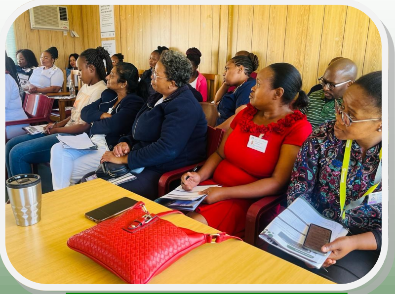
Attendees of the event