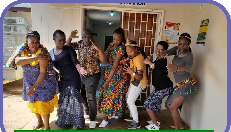
Human Resources Department