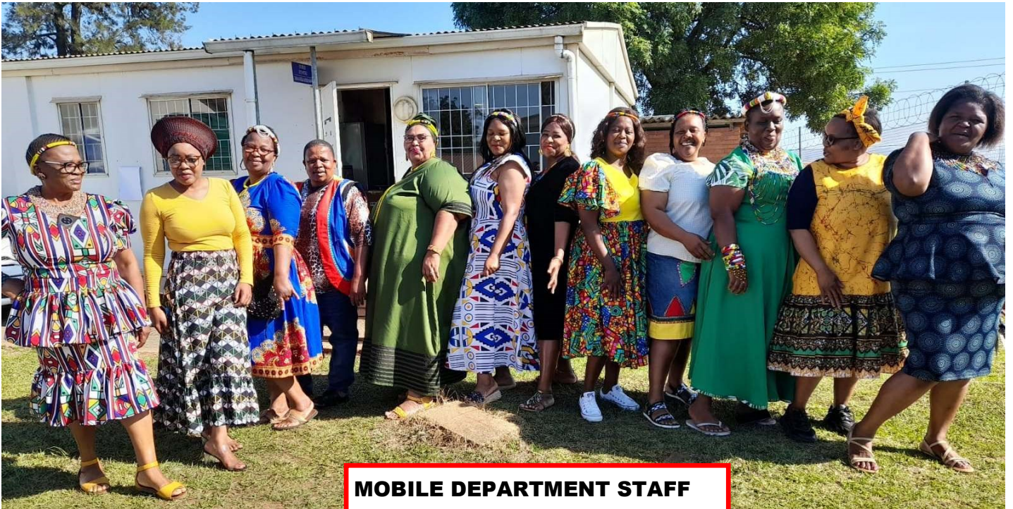
MOBILE DEPARTMENT STAFF

The Ndwedwe CHC celebrated the Heritage Day on the 22 September 2023, the theme of the day was “AZIBUYELE EMASISWENI” meaning back to my roots. Heritage Day was once known as Shaka’s Day and it celebrated Shaka Zulu, the Zulu king who formed the zulu nation. It was the Inkatha Freedom Party who renamed Shaka’s Day to Heritage Day. This was done so that other traditions could be celebrated on this day. The newly named Heritage Day was first celebrated in 1995. Heritage plays an important role in promoting cultural diversity, social cohesion, reconciliation, peace and economic development.