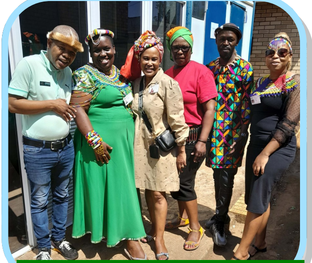
Acute Department Staff