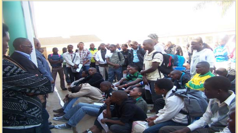
Amakhosi ayekhuluma nabo abafana ngokuziphatha kanjalo nokulindleke kubona kwiCamp. oChaplain nabo babamba iqhaza elikhulu.