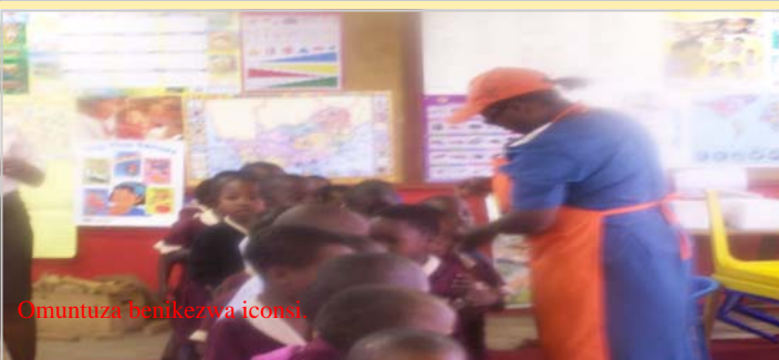
Umuntuza benikezwa icost.