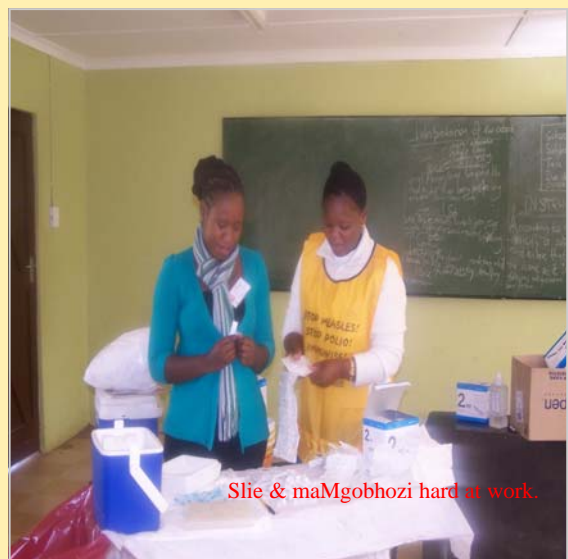
Slie & maMgobhozi hard at work.