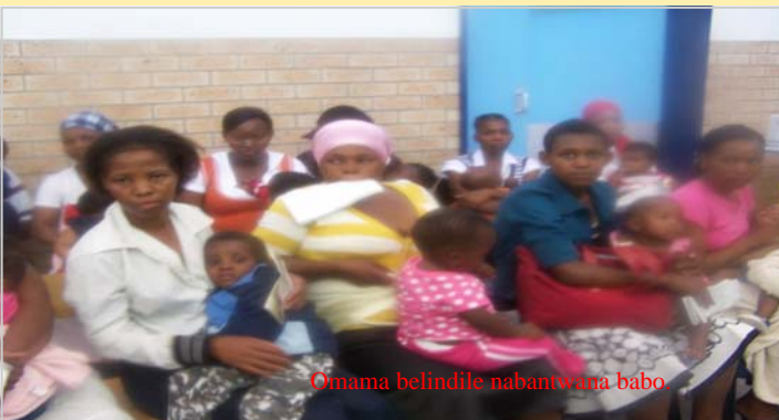
Ornana belindle nabantwana babo