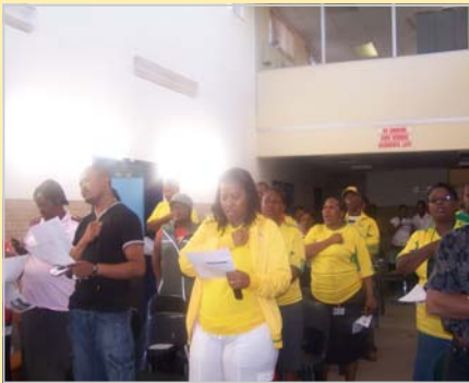
Staff members singing the National anthem with pride.

Ndwedwe CHC celebrated 20 days (21 May 2010) just before the World Cup kicked off in our own back yard, the spirit of togetherness was felt among staff members, who came out in full support of Bafana bafana in yellow and green, welcoming the world to Africa. Different activities took place on that day and the enthusiasm among staff members really showed that they were really behind the South African team.