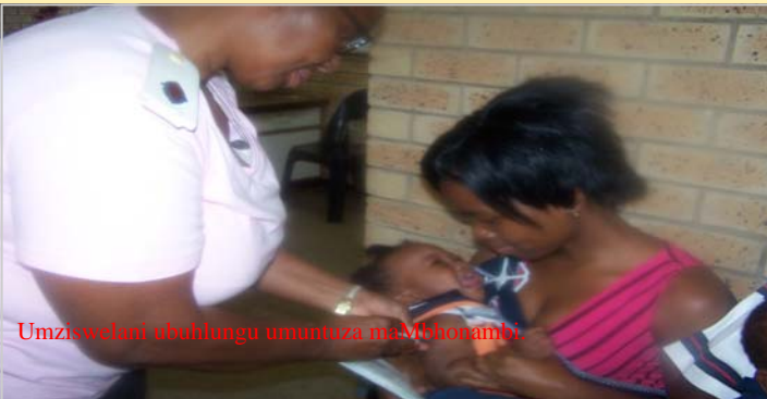
Umziwobani abuhlungu umuntuza maMkhombani.