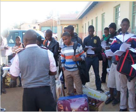
Abanye babafana befika kwiCamp.

Nangempela izisebenzi zomyango weZempilo ziye zasukuma zenza njengoba kushiwo, lokhu phela ku-fakazelwa ngama Camps ekade enziwa kumaDistricts ahlukene, kusokwa abafana ngendlela ephiphile futhi ehlanzekile. Nathi njengeiLembe Health District siye senza njengokuyalelwa sabamba eyethu iCamp ngomhlaka 06 July kuyakumhlaka 07 July 2010 endaweni yakwaMphumulu eVukile High School. Bangaphezu kwamakhulu amabili abafana abaye benziwa kanti iminyaka yabo ibiphakathi kwengu 14 kuya ku 26 ubudala. Baye bachazelwa ukuthi kungani kubalulekile ukuba basokwe, amakhosi ekade ekhona aphinde abafundisa ngezindlela zokuziphatha uma ungumuntu wesilisa ngoba ukusoka akusho ukuthi ngeke usangenwa izifo, koda kufanele umuntu aqhubeke nokuzinakekela, avikele nabesifazane. Amakhosi ashumayele ukuzithiba ukuze isizwe sikaMthaniya siqhubeke nokwanda.