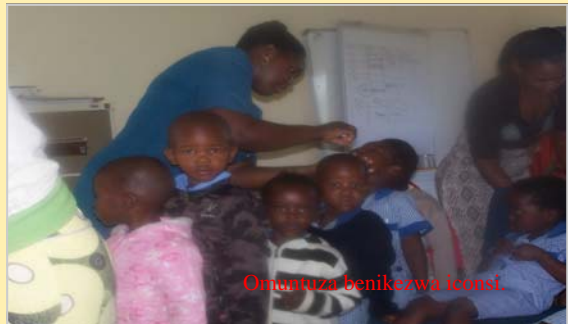
Umuntuza benikezwa icost