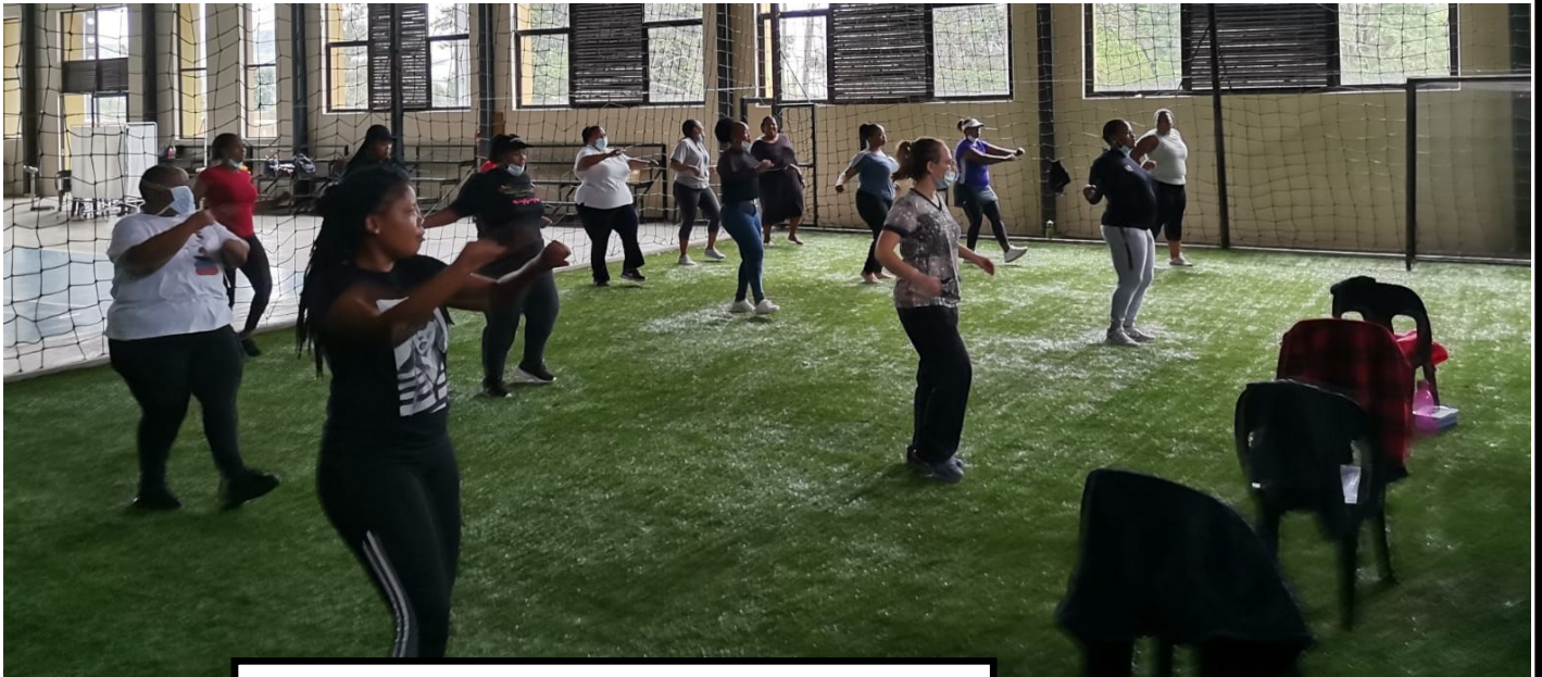
Photos of staff during aerobics

Employee Healthy lifestyle is a very important topic or area of focus for any organisation as it has a vital impact on employee productivity. Hence Richmond Hospital hosted their annual healthy life-style awareness to promote healthy living, on the 18 February 2022 at Richmond sports complex. The day was full of joy as the event was done in an edutainment style: various wellness talks and different aerobic styles were included. There were over 50 staff members who participated on this day.