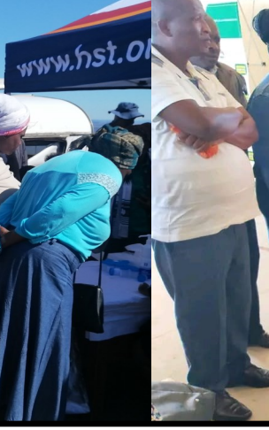
Community receiving services and those in the waiting area.