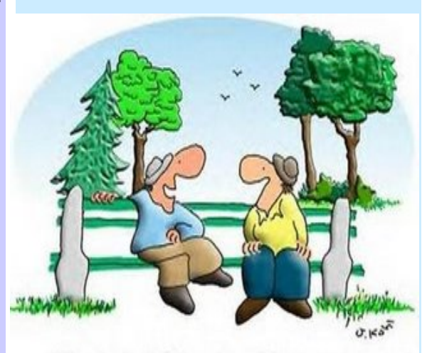
"My doctor told me to avoid any unnecessary stress, so I didn't open his bill."