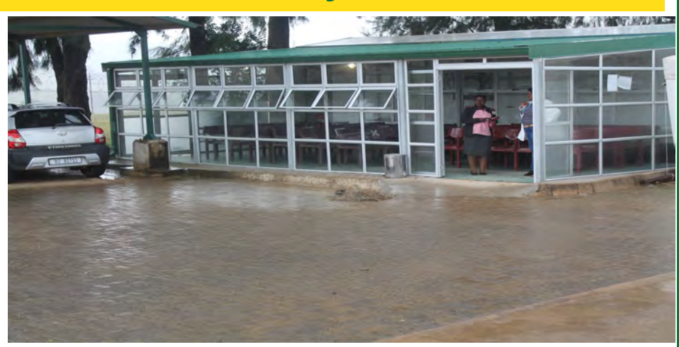
Kilmun Clinic Waiting area in Chronic stream

I affirm my commitment to serve with humanity and respect the community in our catchment population which they are our valued beneficiaries of our healthcare services.