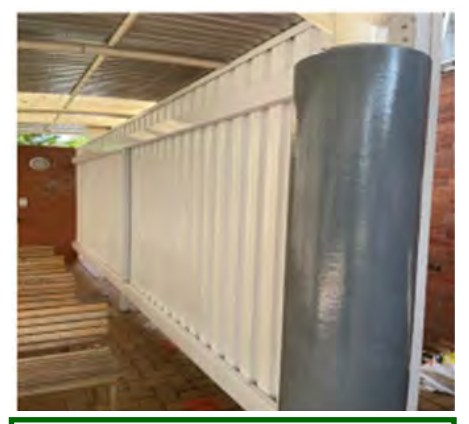
BEFORE—WAL-WAY TO NEW OPD SIDE SHEETING