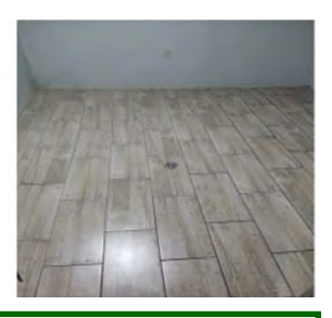
COLD ROOM FLOOR—AFTER