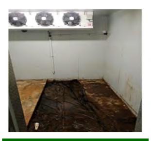
BEFORE, THIS IS HOW COLD ROOM FLOOR USED TO LOOK