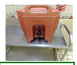
AFTER TEA S SERVED IN THIS INSULAT-ED BEVERAGE SERVER THAT CAN HOLD OR HOT BEVERAGE FOR 5 HOURS