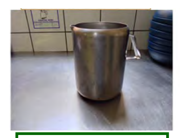
TEA BEFORE SERVED IN THIS CONTYAINER IN THE WARDS