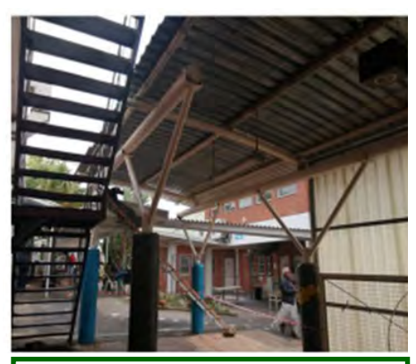
BEFORE—WAL-WAY TO NEW OPD SIDE SHEETING