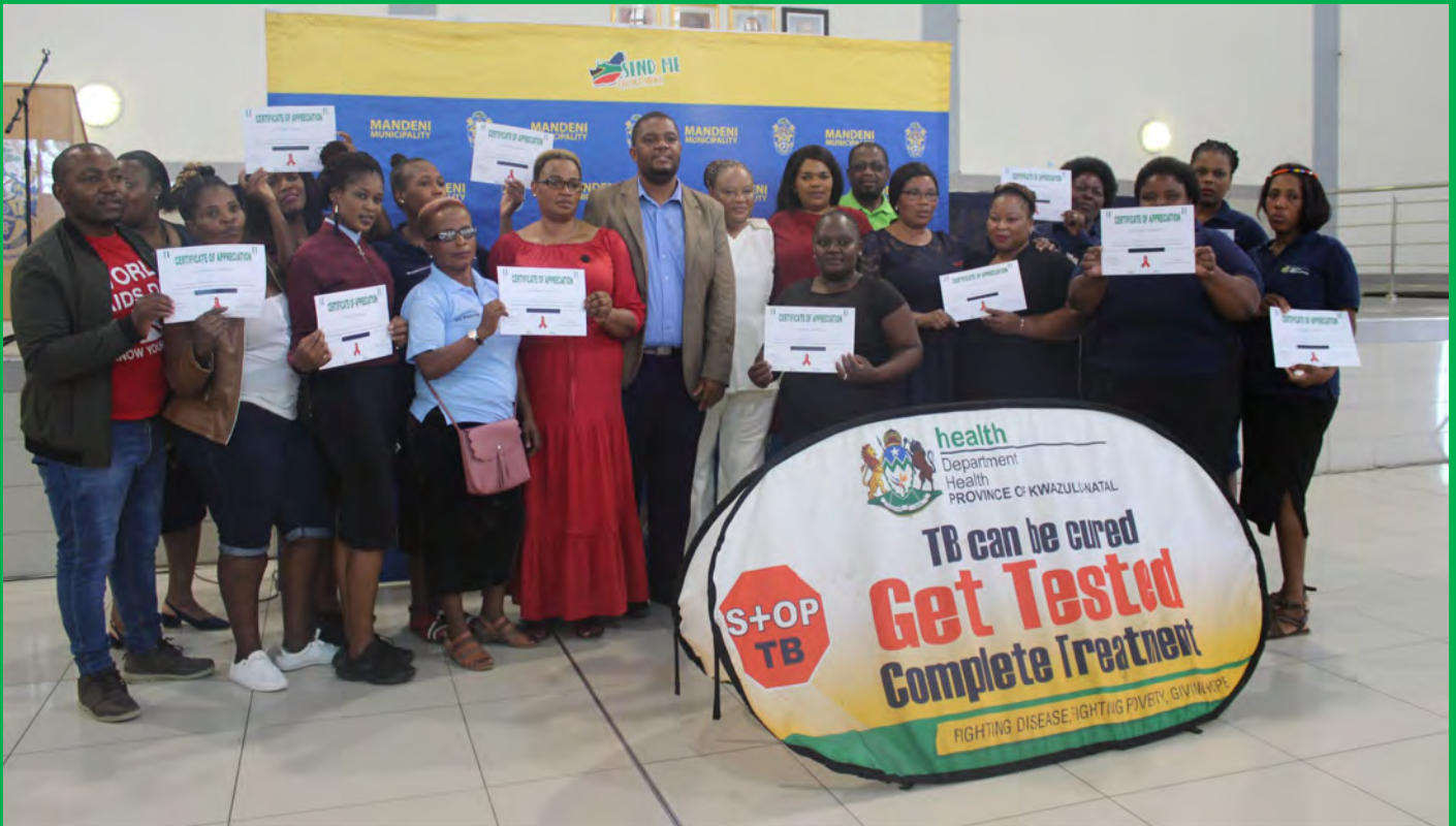
It was a day of HIV/AIDS Awareness day combined with Mandeni Sub-District Community Health Workers recognition. More on Page 4 & 5