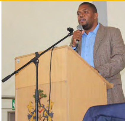
Left: Hon. Mayor Cllr. Mdlalose