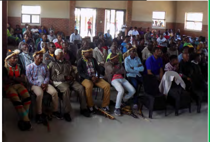
The audience listening attentively