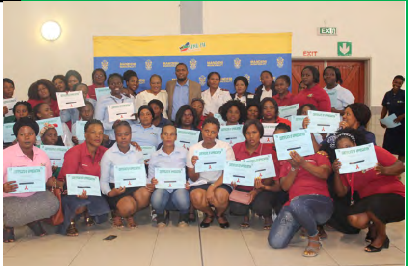
The CHW's after receiving their certificates of appreciation

Truly working together we can do more, appreciation to Mandeni LTT for partaking, CHW's for attending and the community at large for making it a huge success.