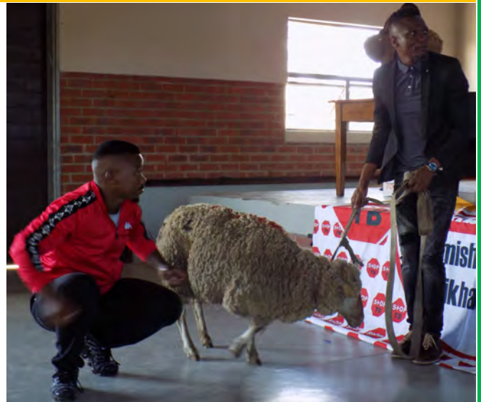
The sheep as a token of appreciation to the Prince