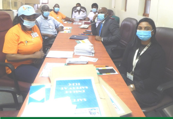
Senior Management Team listening attentively to the Complaints, Compliments and Suggestions training.