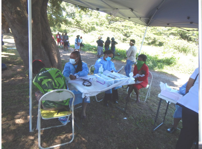
Mobile team at Frasers