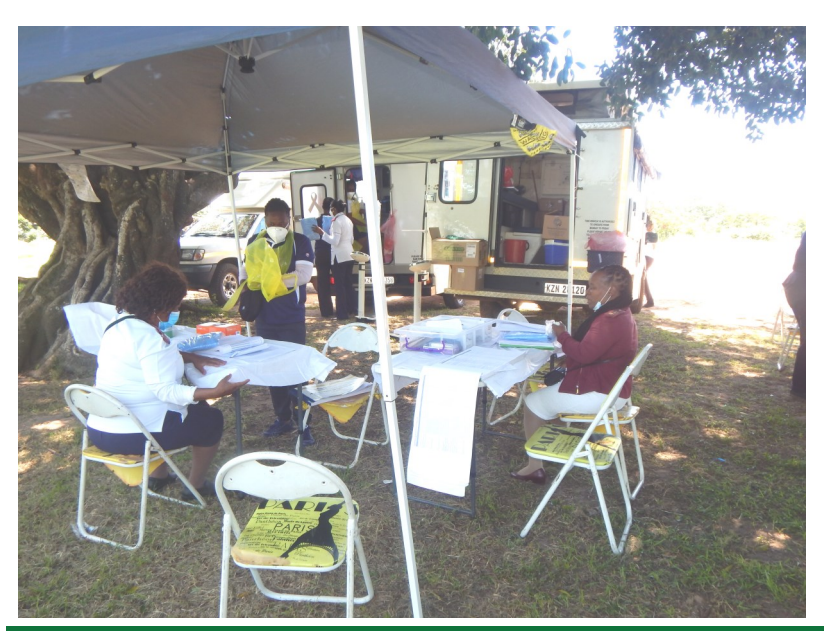
MOBILE TEAM DURING THE FRASERS WELLNESS CAMPAIGN