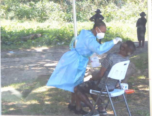
Nurse conducting a COVID-19 swab at the campaign.