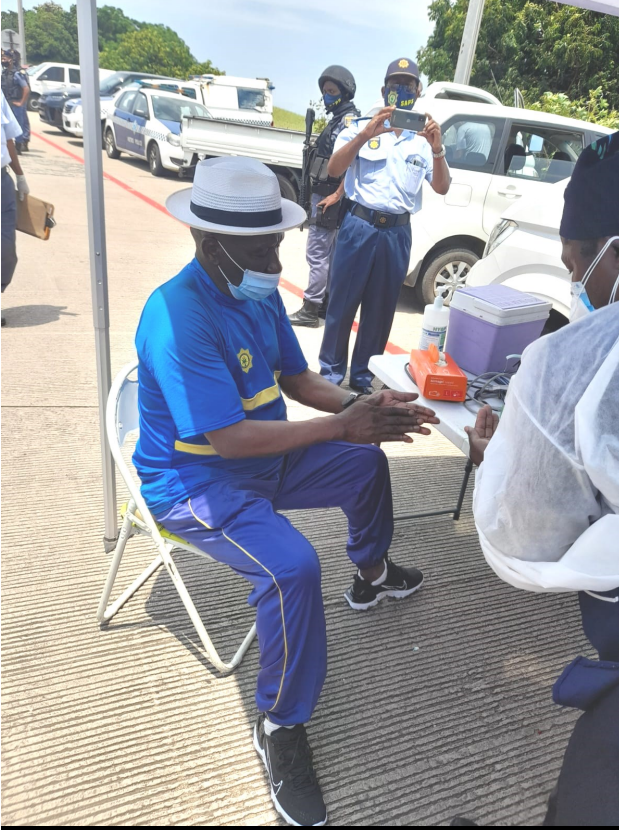
Gen Bheki Cele accessing health care services from Tongaat CHC staff members.