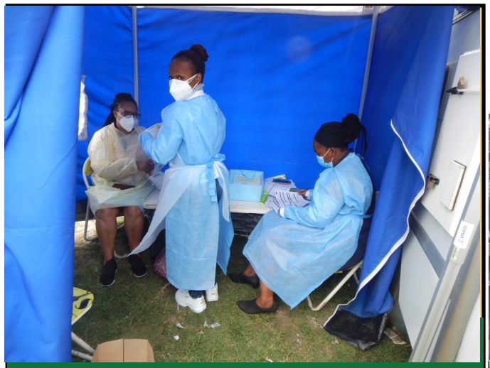
Mobile staff preparing to start the campaign at Magwaveni mobile point.