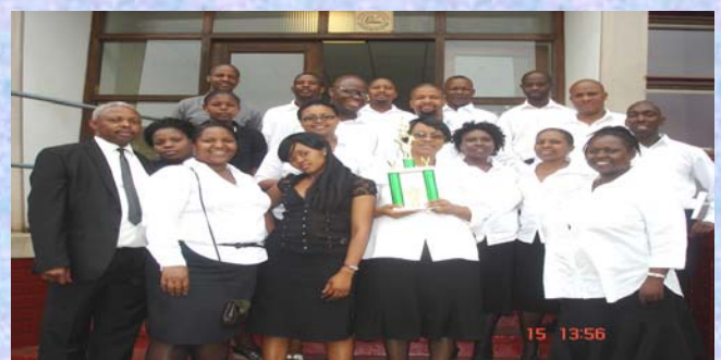
The Choristers showing off their trophy that they have won.

To all Town Hill Hospital choir members, indeed, you have shown love and patriotism for your institution . Keep on lifting up the name of Town Hill Hospital.