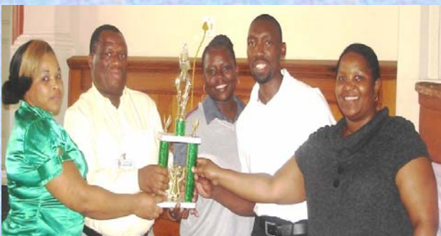
Some of the Hospital Choir members officially receiving the trophy they have won during music competition