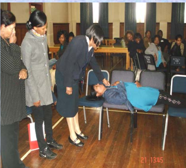
Staff members putting BP into practice showing how to treat patient with courtesy