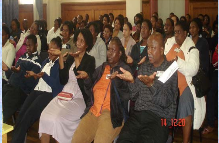
The staff demonstrating the Belief Set: We Belong, We Care, We Serve

The staff was reminded that the infringement of patients rights is the violation of the constitution of SA as the constitution states clearly that all people should be treated with dignity and respect irrespective of their race, colour or gender. It is now up to the individual to implement what he/she has gained from the workshop. In fact, one thing that we