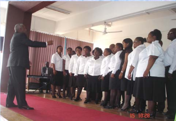
Town Hill Hospital Choristers in Action

On the 15th of October 2011 Umgungundlovu Health District held the music competition which was held at Edendale hospital. Most of the health facilities under Umgungundlovu District were part and parcel of the event.