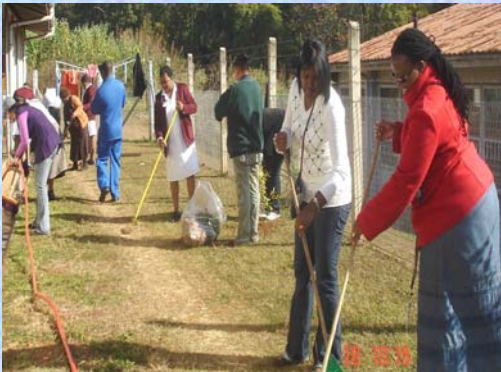
Some of Peacehaven ward staff cleaning the ward premises