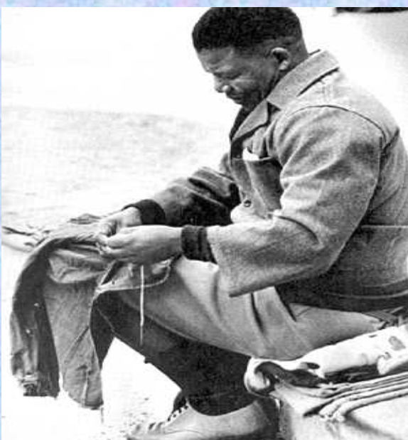
Dr Mandela in Robben Island

enjoy the benefit of this freedom today because of Mandelas, Sisulus, Mbekis, Slovos etc. it is now left with the people of this country to safeguard our gains of democracy which Mandela fought for. This is the man that almost spent his entire life struggling for you and me to be where we are today. It is for this reason that the SA government honoured this icon by declaring 18 July of every year as the day where people are requested to spend at least 67 minutes of their time doing community services. Our young democracy can only flourish if all citizens of this country play a meaningful role in advancing the