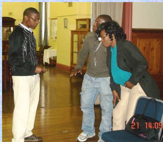
This is a pregnant women accompanied by her husband asking for help from the staff