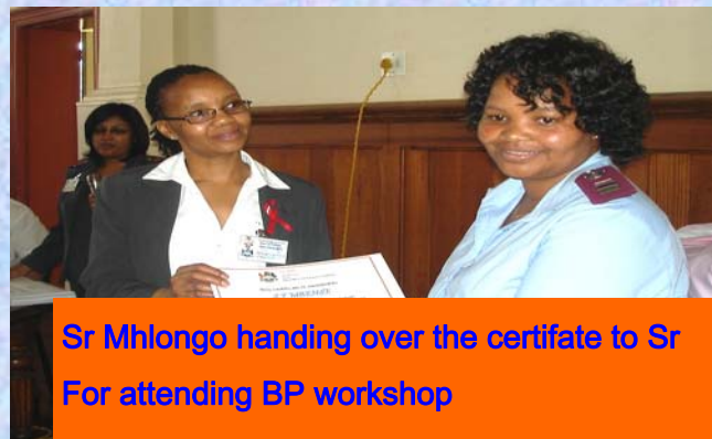
Sr Mhlongo handing over the certificate to Sr For attending BP workshop