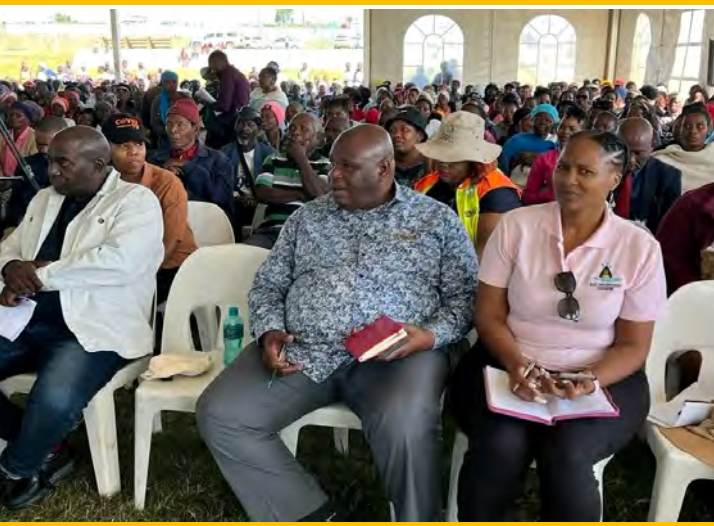
Ugu District Community attending OSS Cabinet