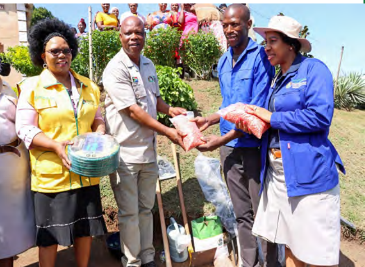
MEC Mr Super Zuma during OSS Cabinet