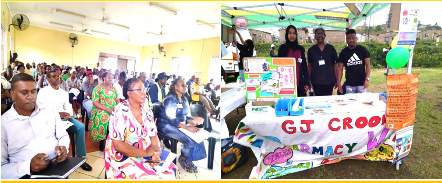
Community engagement at Malangeni Hall