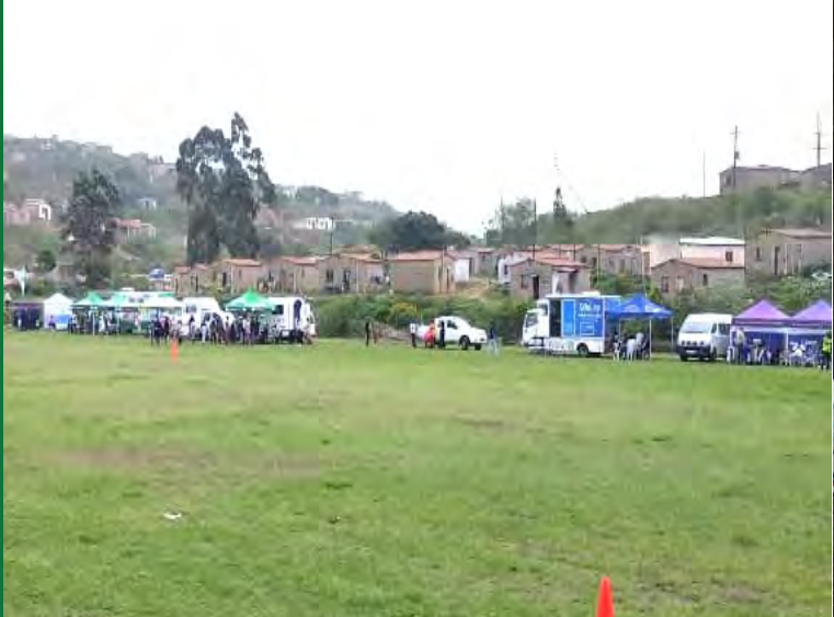
Community accessing services during Isibhedlela Kubantu