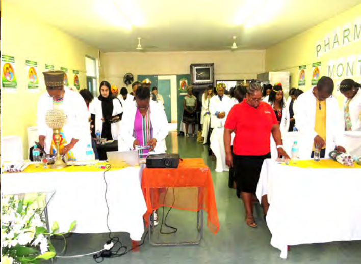
Observing a moment of silence during the event