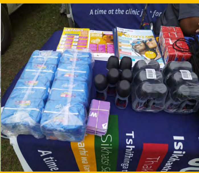
Incentives for youth who accessed services on the day

South Africa celebrates Public Service Month annually in September. This month is a reminder of what it means to serve communities and to consider how the government impacts service delivery. During this month, mostly deprived communities are being visited by public servants from different departments and organizations.