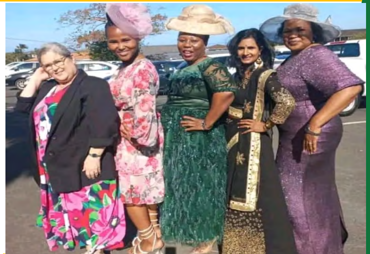
Abaphathi siFunda bebekhiphe eyokugcina inqephu kulomcimbi wabesifazane bomnyango obusehholo I Uvongo