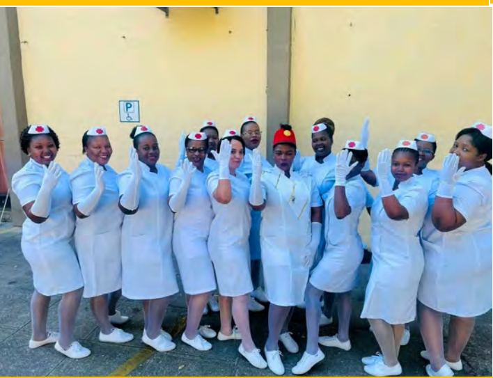
Abahlengikazi besibhedlela I Port Shepstone abahlangabeze uNgqongqoshe ngesizotha ezothamela umcimbi