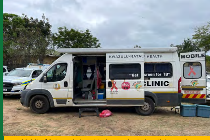
Mobile Clinic assisting elderly people during diabetes day

Ugu Health District health care workers visited Margate Retirement Village on the 14th of November 2023 to spent time with old people staying in the village. Every November 14, World Diabetes Day is commemorated. This is an opportunity to raise awareness about the impact of diabetes on the health of people and to highlight the opportunities to strengthen the prevention, diagnosis, and treatment of diabetes. During this day health care workers join forces and educate communities about diabetes.