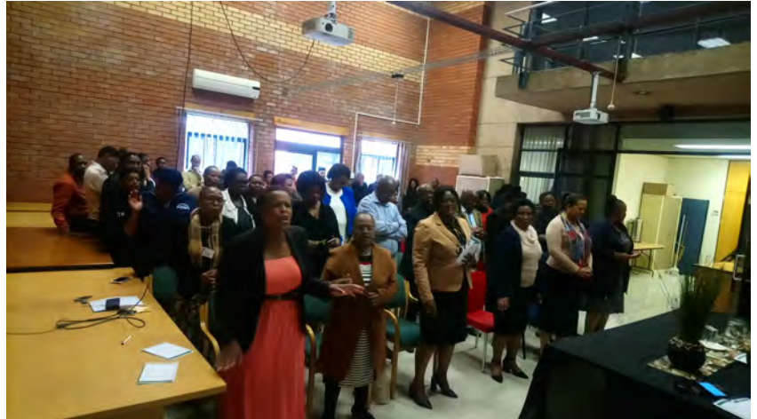
District staff members during the prayer session