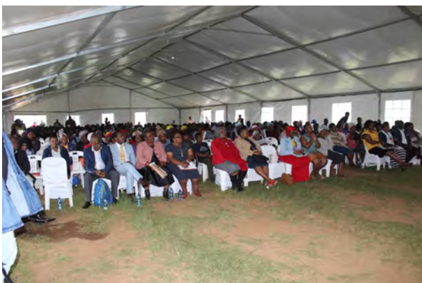
Community members came in numbers to attend the World AIDS day commemoration in Richmond

The prevalence of the HIV/AIDS pandemic in South Africa is very high and KZN is amongst the provinces with the highest number of individuals infected with HIV. At the event it was clear that the message was that everyone should take part in the prevention of new infections, finding new ways of fighting the disease and ensuring vulnerable groups in society are protected. Attendants received varied services including health screening, department of social development, and more.