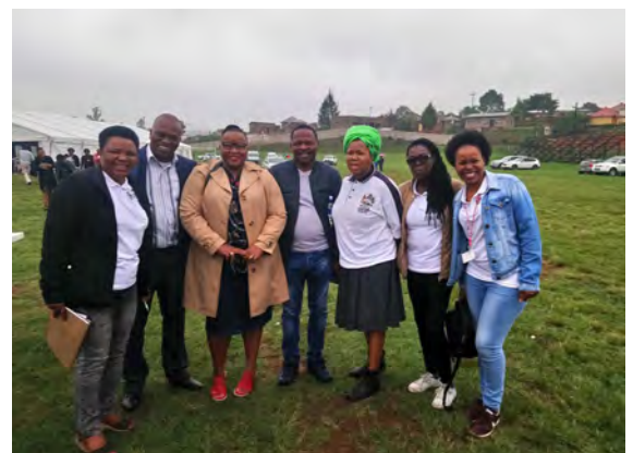
Some of the management team members from uMgungundlovu Health District at the event