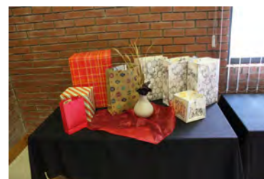
Some of the gifts presented to MaZuma