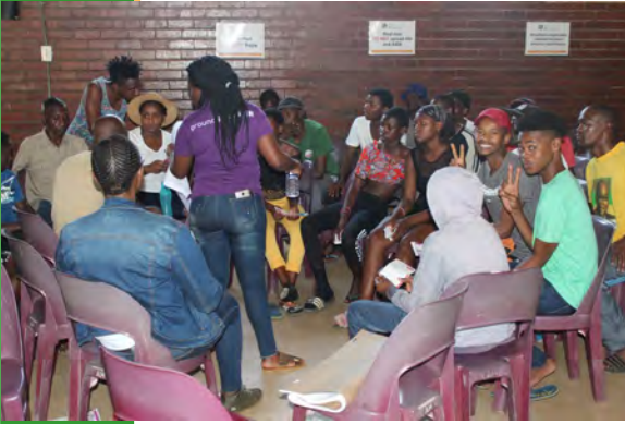
Group discussions by the youth included GBV, HIV, TB, STIs, Teenage pregnancy, Safety, Leadership, Drug and alcohol abuse

On the 21st of November 2019, activation of the She Conquers campaign targeting youth of Ashdown community took place at Ashdown community hall. The event targeted youth and its focus was on Gender-Based Violence (GBV). The event was one of the District events commemorating 16 Days of Activism against women and child abuse campaign.