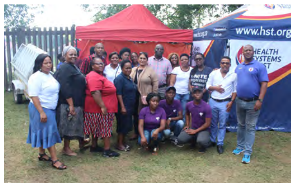
The team included Head Office, District Office, Edendale Hospital, Imbalenhle CHC, Ashdown Clinic, Local Leadership, District Partners