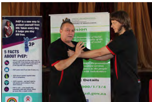
Two self-defense instructors demonstrated various ways of defending oneself. They reminded the community to always be aware of their surroundings because criminals mostly strike when you are unaware or distracted

The event had information and exciting content that was age-appropriate. Entertainment from local youth proved that Ashdown community is talented; it included Poetry, Music, Stage Play, Rap, and Isicatham-ya.