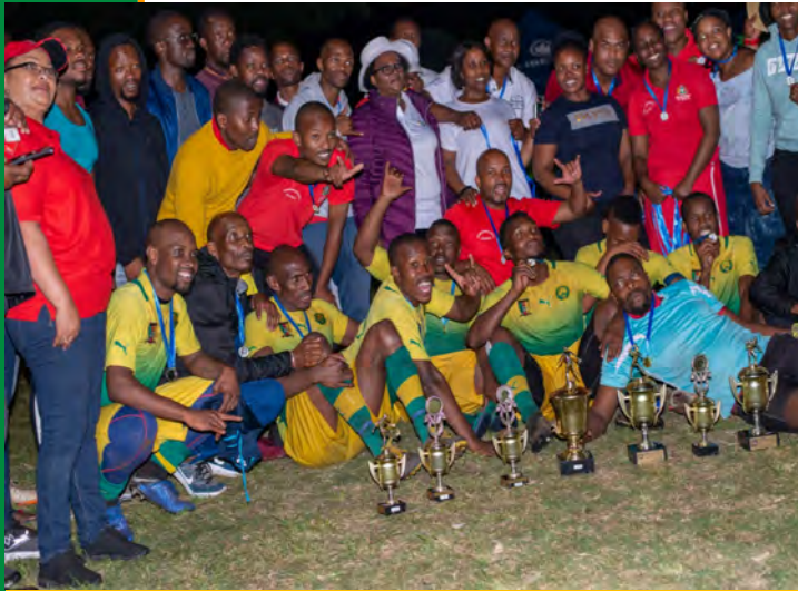
On the of 24th of November 2019, uMgungundlovu District soccer team came out victorious and became the 2018/2019 financial year KZN Health soccer champions.

Umgungundlovu Health District was on a winning streak during the KZN Department of Health Sports and Recreation tournaments. On Friday 22 November 2019, a sunny day in Richards Bay Sports Complex, uMgungundlovu District soccer team accomplished victory over uMzinyathi District in soccer finals at the annual KZN Health Provincial Sports Tournament. The District beat Umzinyathi with 4 goals.