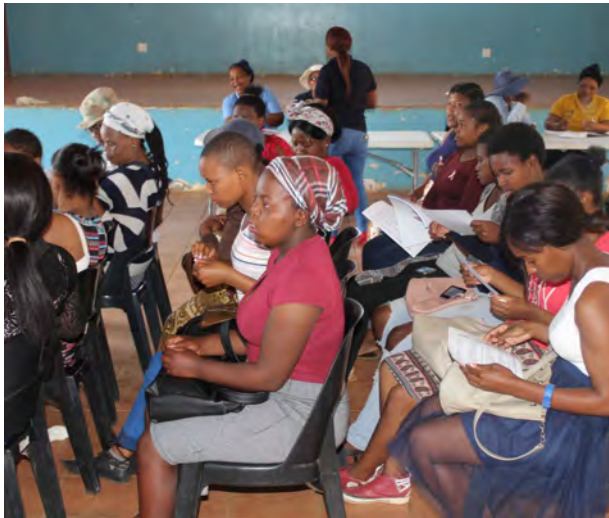
Waiting after consultations. Upon registrations, attendees received a pink ribbon and information on breast cancer as this was October, a month for Breast Cancer Awareness

uMgungundlovu District in collaboration with local health facilities under the Vulindlela Sub District in Msunduzi Municipality embarked on a mass Long-acting reversible contraceptive method (LARC) campaign aimed at all women from Vulindlela and surrounding areas who are of childbearing age.