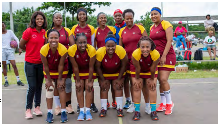
The netball ladies did very well and achieved second position for uMgungundlovu District.

uMgungundlovu district's Netball team played very well during group stages. They reached semi-finals and won all their games leading to finals. During finals, the team became runner ups losing against King Cetshwayo District, the winners had 20 goals whilst uMgungundlovu was just one goal behind a draw at 19 goals.