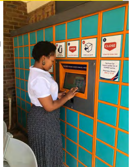
Demonstration of the utilization of the Pelebox at Gcumisa Clinic. It is as easy as A,B,C

that other people will see the type of medication when they take it from the machine but this is not true. All meds are closed and packed · Access to a cellphone— when you register, you utilise your cellphone number and get an One-Time-Pin to access your medication. The cellphone number must be updated when you change your number. If you don't have your own cellphone, you can use another person's phone as long as they will inform you of your OTP. Clients are encouraged to familiarise themselves with the Pelebox and recommend fellow patients to utilise it.