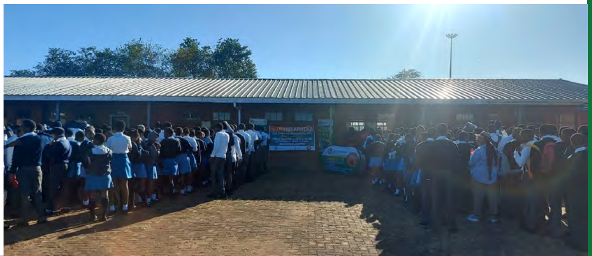
The team interacted with students at Mpolweni Secondary School. The scholars were happy to share their knowledge on TB and other illnesses of concern

The event ended with all stakeholders signing a pledge, to commit to the advancement and complete support of health services in the area including the district as a whole.