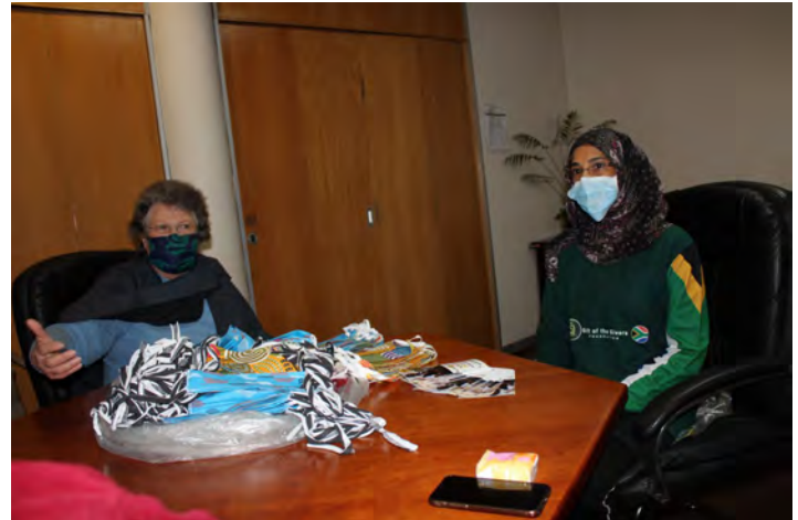
Gift of the Givers representatives handed over cloth masks to uMgungundlovu District

community screening. The masks came with more information about the COVID-19 virus, how to limit the spread, and how to use and care for them.