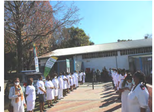
Staff Members at the Royal Show Grounds Field Hospital during the official opening

When the team was informed that they must wait for their first group of