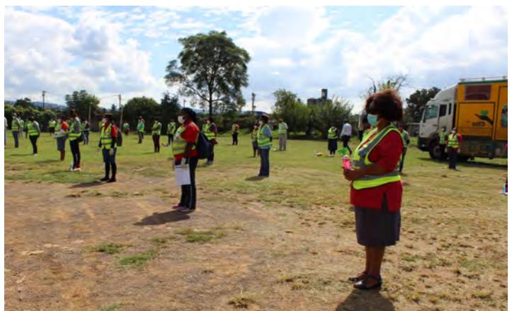
Different Health Care Workers at the Launch, ready to go to house-to-house in groups of two for Covid-19 Screening at the Jika Joe Informal residence. The Premier thanked all the dedicated members and asked the community to allow them to their households

The Health Care Workers were identified by their reflector vests and name badges. They were also accompanied by SAPS to ensure their safety, local municipalities announced to the public a day before the visit. All these were safety measures, to ensure that the workers were safe and that criminals did not take advantage of the screening programme and target unsuspecting community members by posing as Health Care Workers. The deployment followed a phased and targeted approach and high-density areas and hotspots were targeted and visited throughout the campaign. The District was allocated a COVID-19 mobile testing vehicle to assist the field workers with testing on the spot. The wonderful work of all HWCs is appreciated.