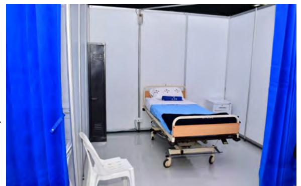
One of the 254 beds ready for use

Zikalala reminded the citizens of uMgungundlovu and KwaZulu-Natal that the Covid-19 virus is fastly spreading under Level 3 Lockdown, citizens must take care of themselves to avoid infection. He encouraged the washing of hands, regular sanitizing with a 70% alcohol-based sanitizer, wearing a clean cloth mask when you leave your home, and maintaining social distancing.