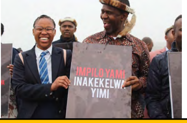
Deputy Minister for Health, Dr S Dhlomo with a student from the local school during the awareness march

empowerment. They fund their higher-education studies, industry related training within the transport sector. The Deputy Minister also mentioned that a list of youth names from the Mpumuza area had been submitted. The youth applied for funding, then the department pays for tuition, sponsors accommodation as well as stipends to buy food during the period of study and training. Health Deputy Minister, Dr Sibongiseni Dhlomo ended the event with a keynote address where he spoke against the social ills including drugs, alcohol, crime, weapons, underage sex, unprotected sex, unplanned pregnancy, teenage pregnancy, sexual relations with adults (sugar daddy or sugar mama relationships) and usage of weapons. The Deputy Minister mentioned all the help that is available for those who require it. "Different sectors, NGOs, and government departments are available for help, you must not suffer alone," said Dr Dhlomo. The signing of a declaration and pledge by all stakeholders took place at the end of the event.