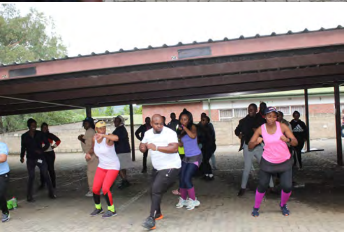
Pictures: 1&2. District director and the team during the walk. 3. Employees enjoying the walk. 4. Stretching after the walk. 5. Endumeni Department of Agriculture team. 6. Aerobics