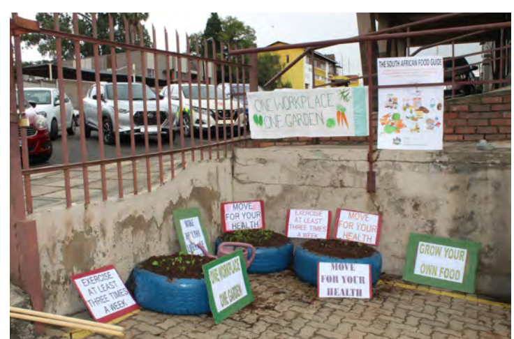
One workplace, One garden project