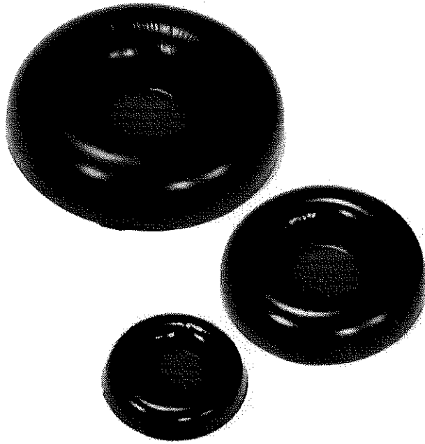
Flat gel pad