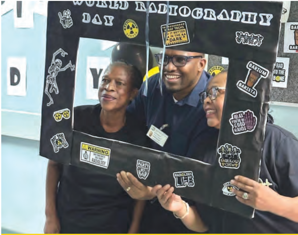
World Radiography Day; Madadeni Regional Hospital