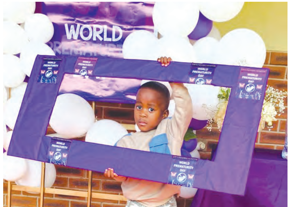
Ntunjambili Hospital, Premature Babies Day