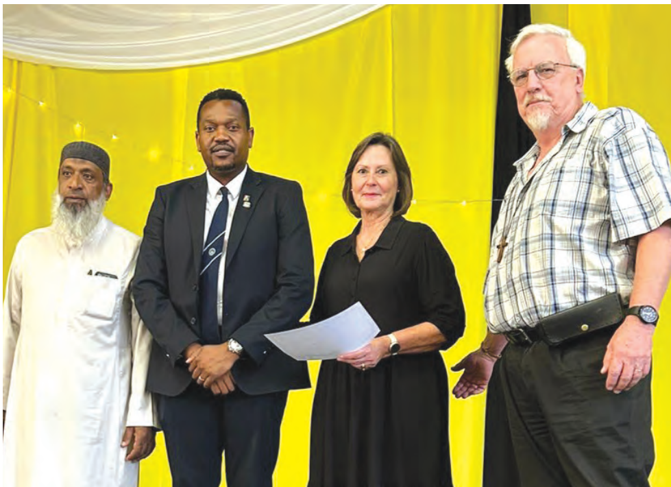
Quality Day, Grey's Hospital