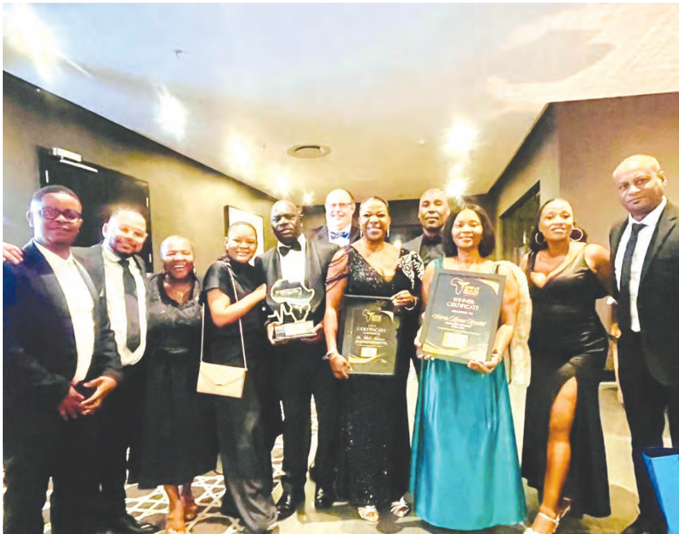
Umcimbi waseThekwini District, kubungazwa abasebenzi ngokuthola iziguli ezinesifo sofuba