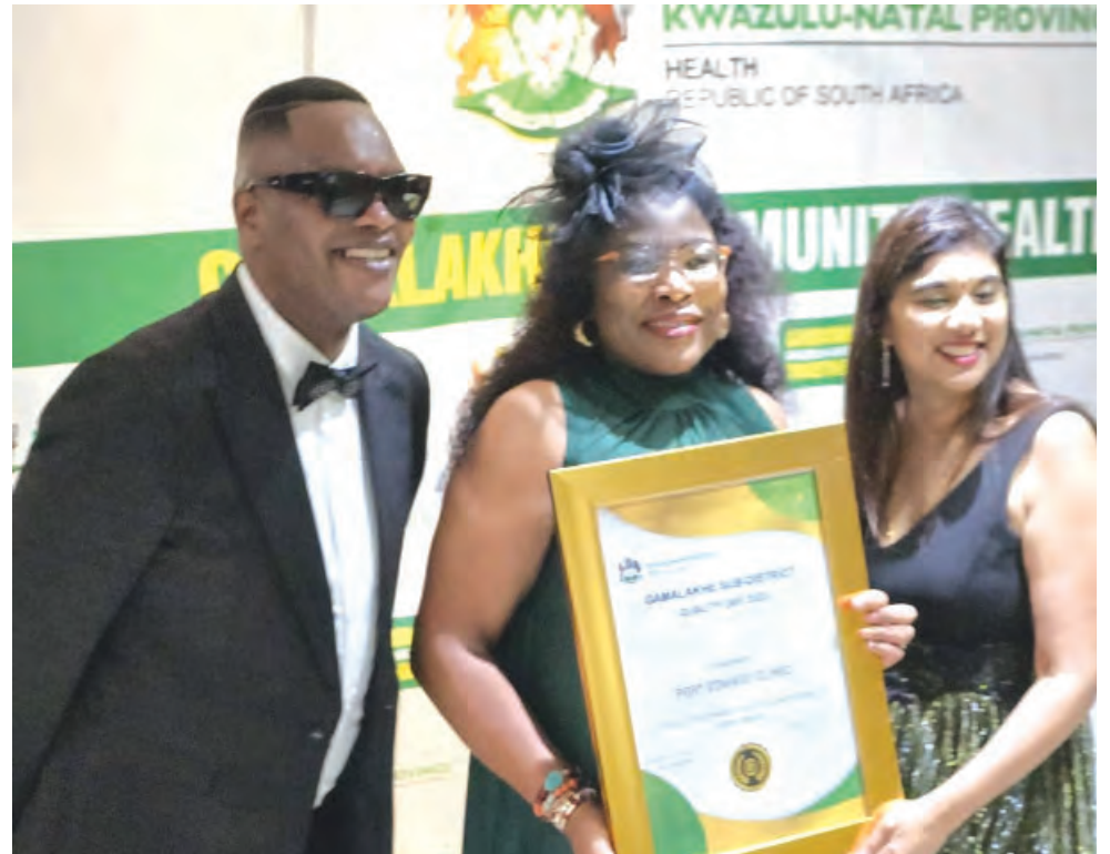
Quality Day, Gamalakhe Sub-District