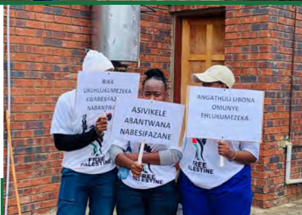
GBV CAMPAIGN. PAGE 01