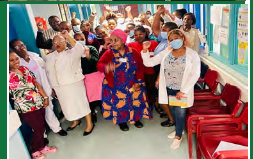
HAND WASH CAMPAIGN PAGE 08