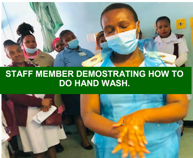
STAFF MEMBER DEMONSTRATING HOW TO DO HAND WASH.