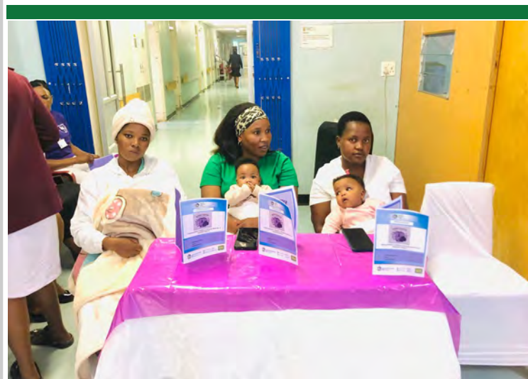
MOTHER'S OF PREMATURE BABIES ATTENDED PREMATURETY DAY.

Health care workers in maternity and neonatal units reaffirmed their commitment to providing compassionate, high quality care to premature babies. Parents and caregivers were encouraged and empowered with information to actively participate in the care of their infants. The commemoration served as a reminder that every baby a fair start requires collaboration between health care providers, families, and the broader community. The hospital remains dedicated to strengthening maternal and child health services to ensure that every baby, regardless of the circumstances of their birth, has the best possible start in life.