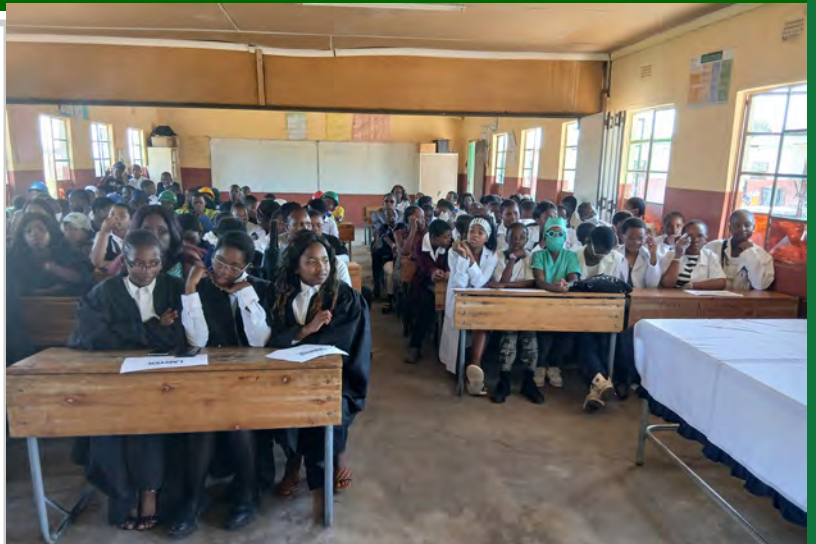
LEARNERS FROM LUVISI PRIMARY SCHOOL ( GRADE07) DURING THEIR FAREWELL.

The Grade 7 Graduation and Farewell Ceremony was both a celebration of achievement and a moment of reflection. As Luvisi Primary School bids farewell to the Class of 2025, it does so with pride and confidence, wishing the learners success in their future endeavours.