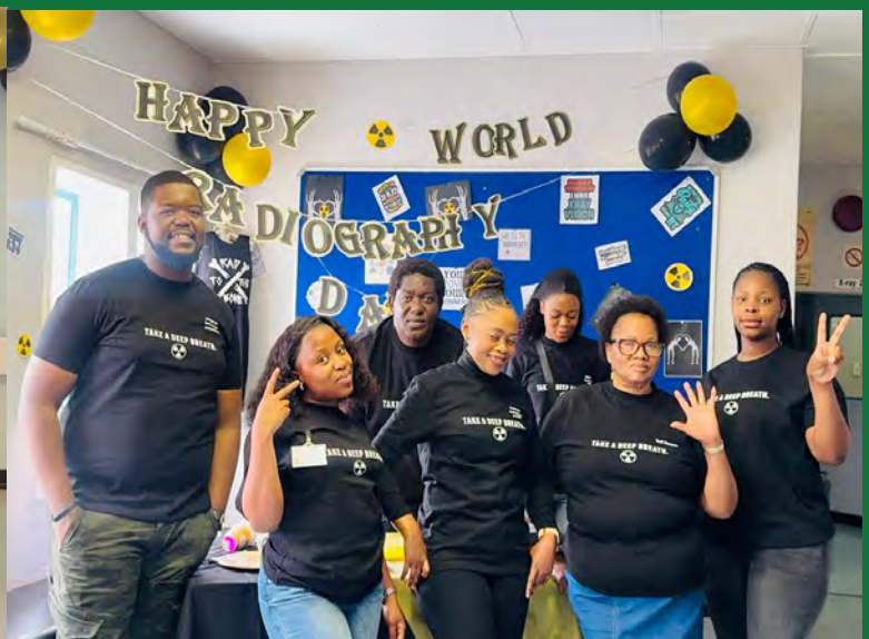
CJM RADIOGRAPHER'S CELEBRATING RADIOGRAPHER'S DAY