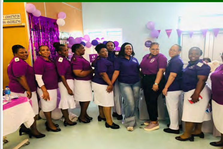
LABOUR WARD STAFF MEMBERS WHO HAVE ATTENDED PREMATURE BABIES.