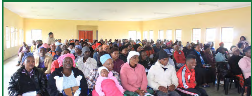
COMMUNITY MEMBERS WHO HAVE ATTENDED DISABILITY DAY AT MPUMELELWENI HALL.