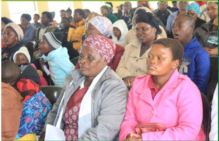
COMMUNITY MEMBERS WHO HAVE ATTENDED DISABILITY DAY AT MPUMELELWENI HALL.

The event also provided an opportunity for networking and strengthening partnerships between the hospital, the municipality, Assupol Trust, and other stakeholders involved in disability advocacy and support services. Such collaborations are essential in ensuring a coordinated approach to addressing the needs of persons with disabilities.