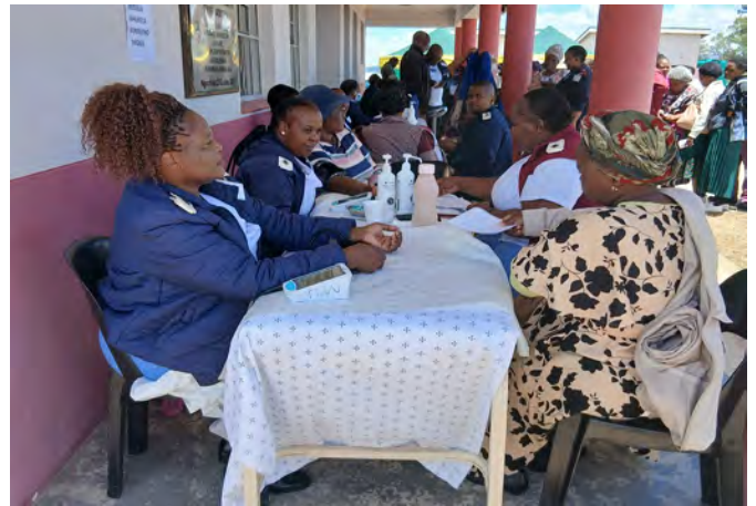
HEALTH CARE PROFESSIONALS ATTENDING TO THE COMMUNITY.