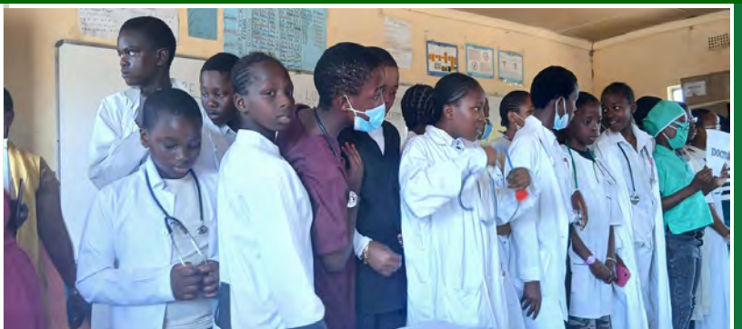
LEARNERS FROM LUVISI PRIMARY SCHOOL ( GRADE 07) WHO WANT TO CLINICIANS .