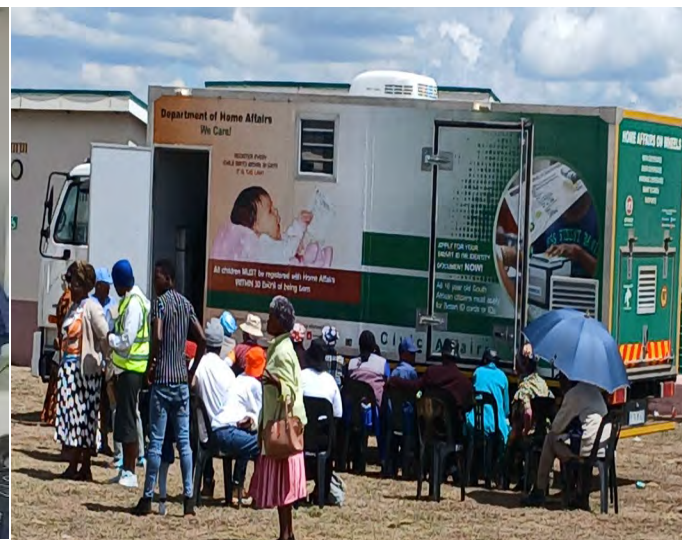
DEPARTMENT OF HOME AFFAIRS WAS AVAILABLE TO ATTEND TO THE COMMUNITY MEMBERS.