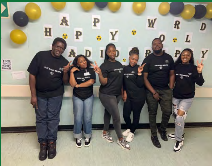
CJM RADIOGRAPHER'S CELEBRATING RADIOGRAPHER'S DAY

The hospital remains proud of its Radiographers and Sonographers and acknowledges their indispensable contribution as the "eyes of medicine," ensuring accurate diagnosis and improved quality of care for patients.