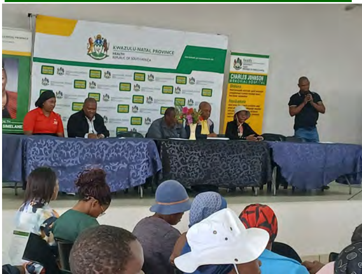
STAKEHOLDERS WHO WERE AVAILABLE TO SUPPORT THE EVENT AT JABAVU COMMUNITY HALL.