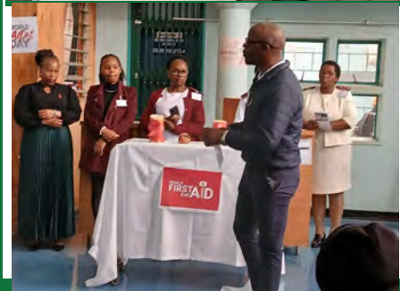
WORLD AID DAY. PAGE 01