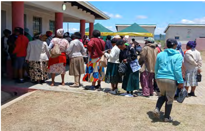
COMMUNITY MEMBERS CAME IN LARGE NUMBERS TO RECEIVE GOVERNMENT SERVICES.

The hospital remains committed to community-oriented primary healthcare and will continue to support initiatives that prompted accessible, integrated, and patient-centred healthcare services for all.