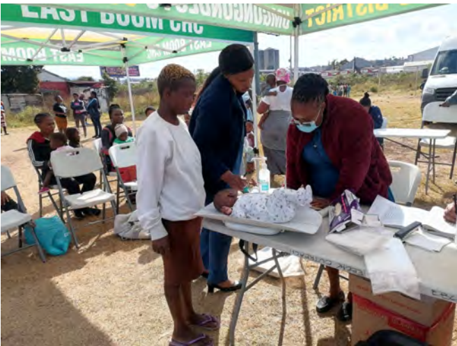
Babies services were done.