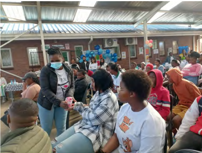
Gifts were given for the questions and answer quiz.