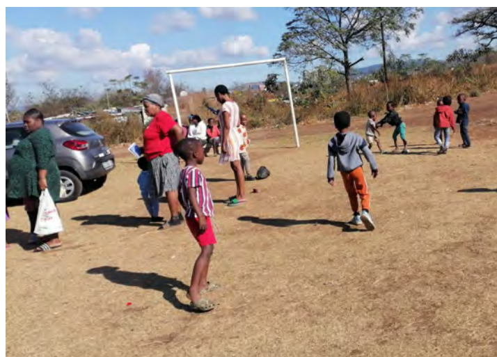
Children playing soccer after being examined.