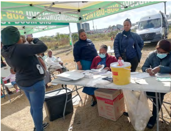
Outreach team visited Masukwane.