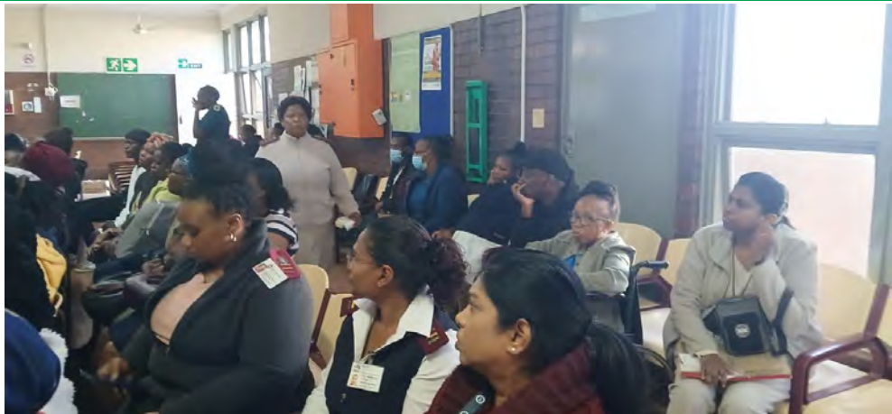
East Boom CHC Management and staffs attended the mental health event