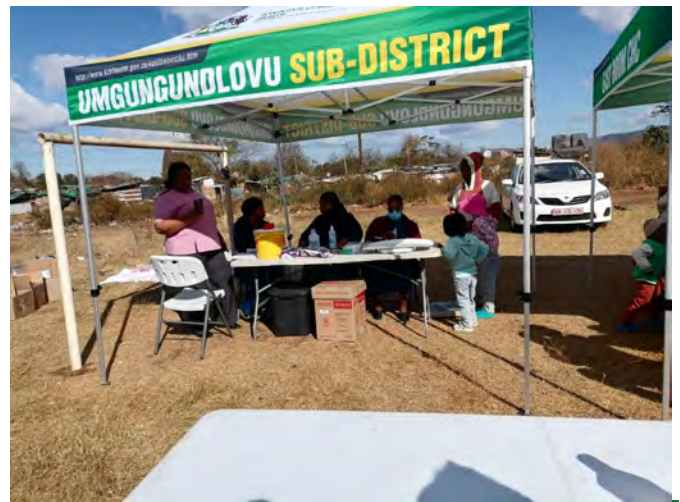
Outreach team visited Masukwane.