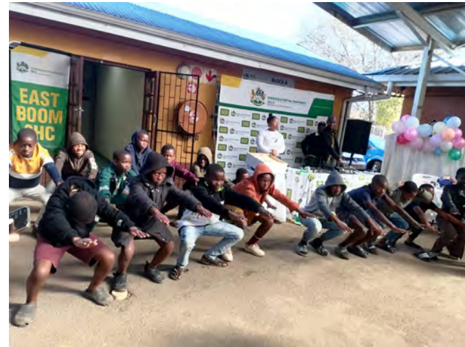
Children participating in exercise activity, by doing squats.