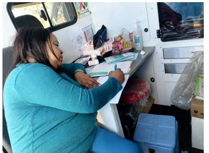
Tilling of states and recording.