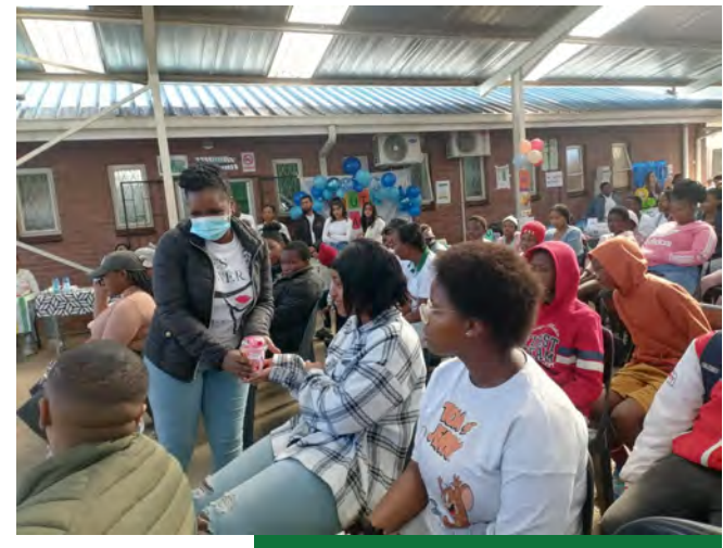
Gifts were given for the questions and answer quiz.