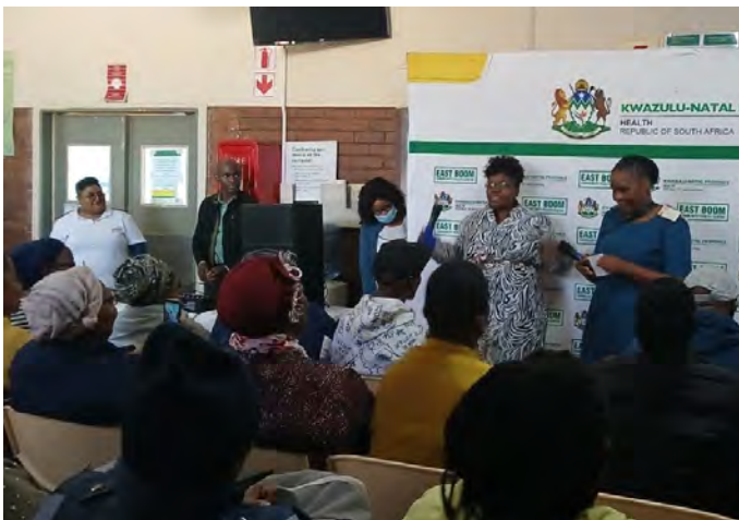
Educational role play done by staffs.