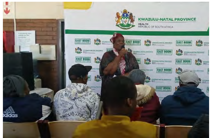
Client who survived depression, and gave advice how important to take care of your mental health.