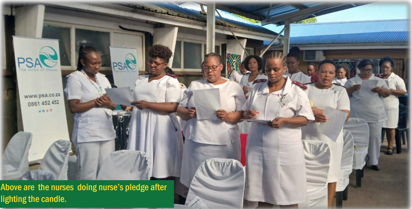
Above are the nurses doing nurse's pledge after lighting the candle.