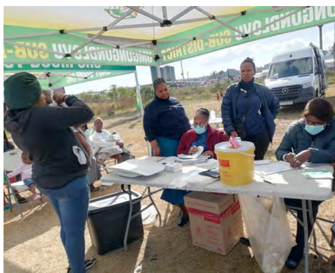
Healthcare workers attending to the mother and child.

On 27 June 2025, East Boom Community Health Centre (CHC) successfully launched the Phala Mntwana campaign, a community outreach initiative aimed at improving child health. The campaign delivered critical services including HIV testing, malnutrition assessments, immunisations, and the replacement of lost or damaged Road to Health cards. The event saw an impressive turnout, with parents and caregivers bringing their children in large numbers to benefit from the services offered. Health professionals provided education, screenings, and follow-up support. The campaign marked a significant step in strengthening healthcare access and promoting early childhood wellness in the region, ensuring brighter, healthier futures for all.