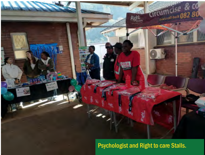
Psychologist and Right to care Stalls.