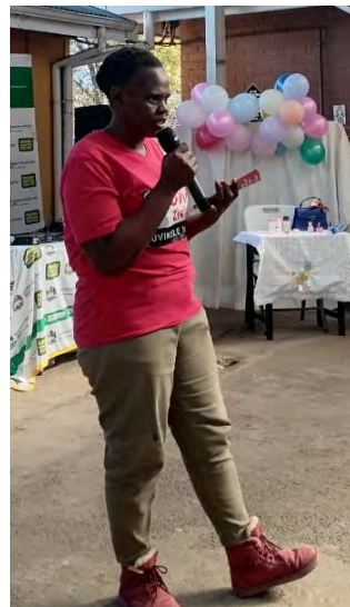
Medical Male Circumcision staff.